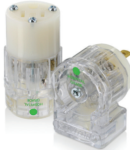
Hospital grade clear