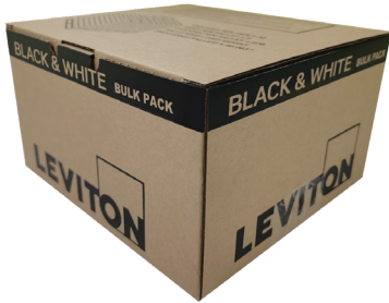
Bulk versions for high volume assembly