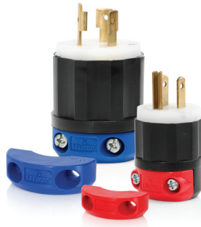
Colored cord clamps