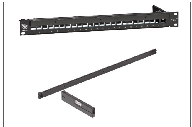
IPSPNLX24SIJ2M (Intelligent Copper Panel) IPSATTRFID001 (Copper Antenna Kit)